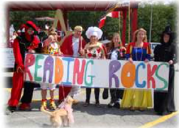
Summer Reading Club Theme at Kitimat's July 1st Parade