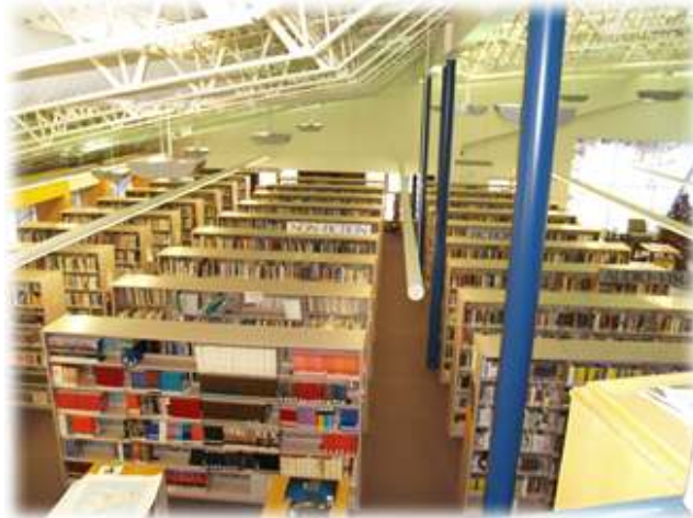
Overlooking the stacks from library archives