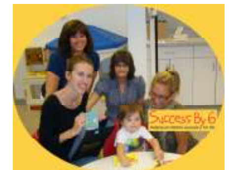
Kitimat Public Library partners with United Way Success By 6 and Kitimat General Hospital to bring books for babies and families to the community.