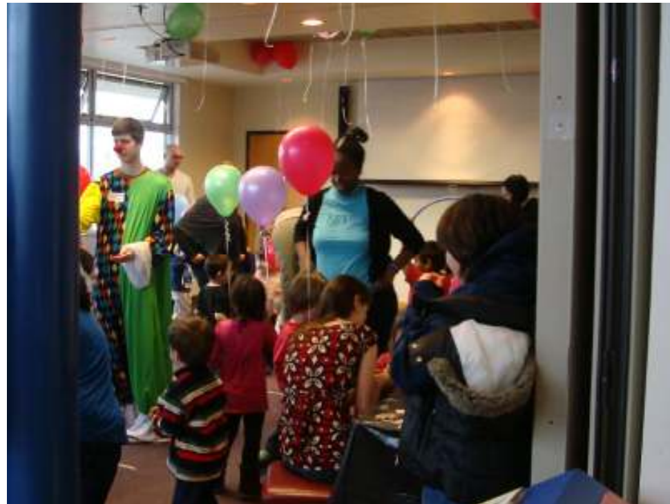
Family Day Carnival - February 10, 2013