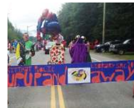
Summer Reading Club participates in the July 1st parade. Superhero crayons, candies and comic books were doled out to excited spectators of all ages.