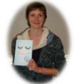
Author Ashley Little "The New Normal"